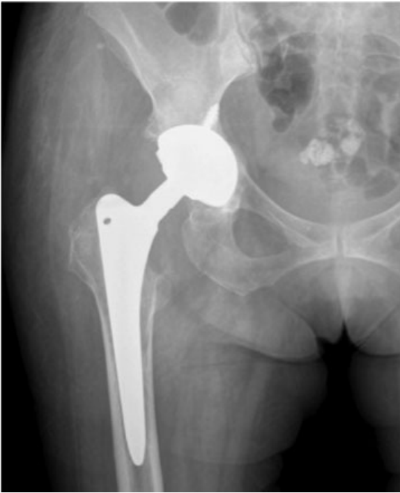
Fig. 2 Postoperative X-ray: a revision with a tantalum cup, reinforced with three screws, with ceramic on ceramic coupling + homologous bone filling of acetabular and trochanteric defects.

The toxicological screening was repeated 1 month after surgery and showed the following results: blood cobalt = 0.15 µg/L; blood chromium = 0.42 µg/L; urine chromium = 0.69 µg/L; urine cobalt = 1.95 µg/L.