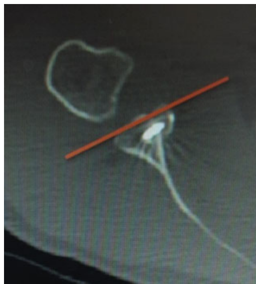
Fig. 2 Position of the graft compared with anterior glenoid edge (computed tomography [CT] axial scan).

Screw positioning was assessed on axial CT scans. Screw divergence was measured as the angle that the screw formed with the articular glenoid surface and was open anteriorly