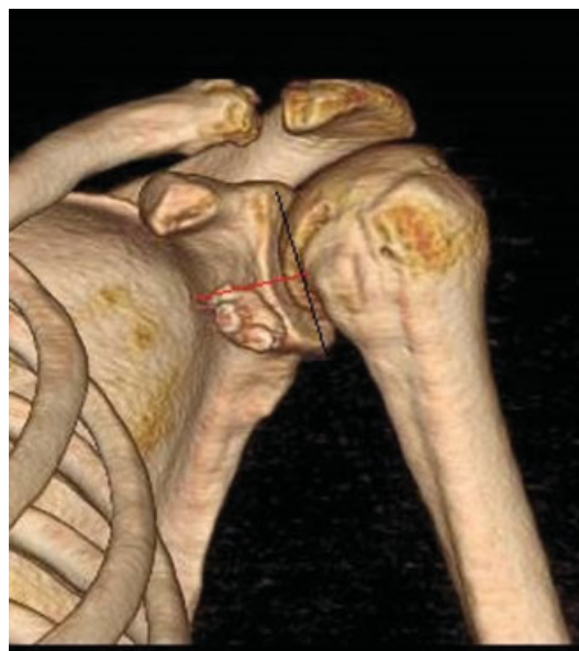
Fig. 1 Position of the graft compared with equator of the glenoid (three-dimensional computed tomography [3D-CT] coronal scan).

At a minimum 1-year follow-up, all the patients underwent an imaging evaluation with standard anteroposterior axillary radiographs and a three-dimensional computed tomography (3D-CT). The following parameters were examined: positioning of the coracoid graft on the sagittal and coronal plane, placement of the screws with respect to the glenoid surface, screw length with respect to the anteroposterior width of the glenoid neck, integration of the bone graft, and signs of osteoarthritis. 10