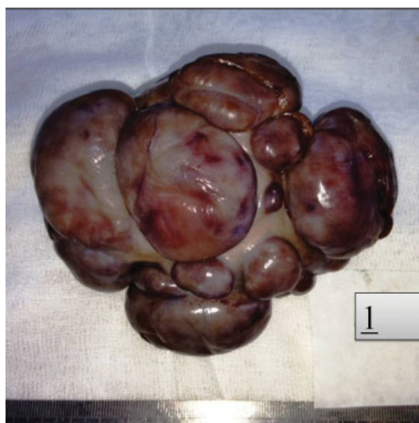
Fig. 1 Gross appearance of the lesion reminiscent of placental cotyledons.

Cotyledonoid dissecting leiomyoma is characterized by disorganized smooth muscle fascicles with extensive hydropic degeneration and marked vascularity. 1 Histological features suggestive of malignancy, such as cytological atypia, necrosis and increased mitotic activity, are absent. 8