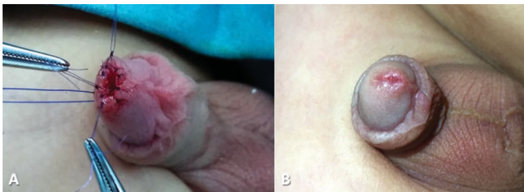
Fig. 2 The prolapsing mucosa was excised circumferentially and a primary repair was done (A). The meatal appearance 6 weeks after the operation (B).

Urethral prolapse has a bimodal age distribution and most commonly occurs in prepubertal black females and postmenopausal white women. 3,5,6 It may either be congenital or acquired. 2,6 The etiological mechanism has not been clarified yet. It may be caused by disproportional growth in childhood, estrogen deficiency, malnutrition, weak pelvic floor muscles,