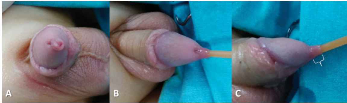
Fig. 1 The preoperative appearance of the urethral meatus is seen in neutral position (A) and with a catheter in (B and C). The prolapsed mucosa was a couple of millimeters long (curved bracelet in C).

This report presents a male child with clinical findings consistent with urethral prolapse and successfully treated surgically.