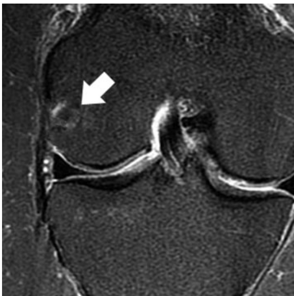
Fig. 2 T2-weighted MR scan with hypointense core plus hyperintense surrounding the lesion (arrow). MR, magnetic resonance.

The patient underwent a surgical LFC curettage and synovectomy with synovial biopsy that was found to be inflamed and hypertrophied with multiple “rice bodies” (► Fig. 3 ). The histopathologic exam revealed granulomatous inflammation with caseous necrosis, suggestive of TB. Polymerase chain reaction (PCR) test for Mycobacterium tuberculosis DNA was positive, resulting in an isoniazid monoresistance profile. The patient was treated with a polytherapy consisting of rifampin, pyrazinamide, and