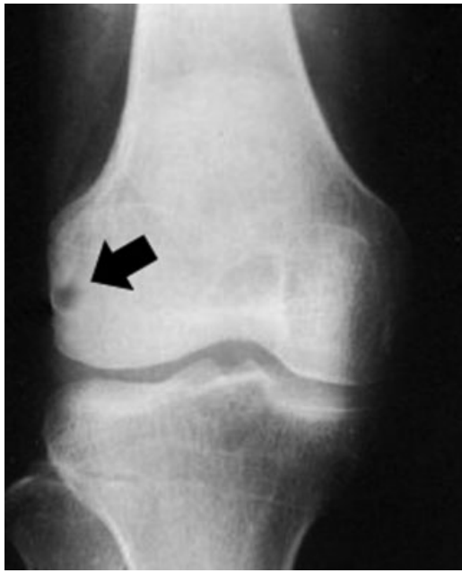
Fig. 1 X-ray of the knee showing a bone lesion (arrow) of lateral femoral condyle.

T2-weighted sequences (► Fig. 2 ). Computed tomography (CT) scans confirmed the lesion, showing a cortical bone interruption surrounded by an area of osteolysis in the LFC.