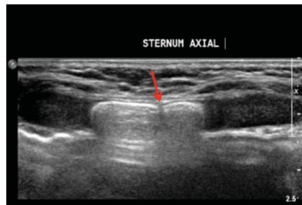
Fig. 4 Transverse ultrasonic image showing the transverse, nondisplaced fracture of the corpus sterni (indicated by arrow).