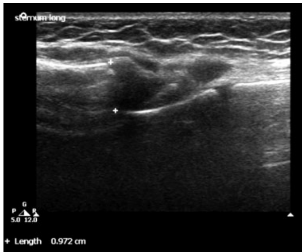
Fig. 1 Longitudinal ultrasonic image showing the transverse fracture of the manubrium sterni with dorsal displacement of the distal fragment by 0.97 cm.