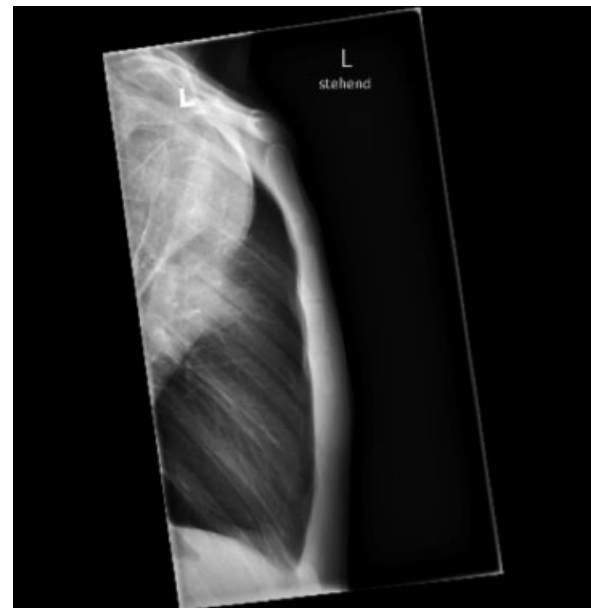
Fig. 3 Lateral chest X-ray without signs of fracture.

noise in the area of his sternum. Physical examination revealed tenderness without swelling above the body of the sternum. Auscultation of the lungs and heart revealed no pathological findings, and the electrocardiogram (ECG) was normal. Anterior–posterior chest X-ray was normal. Ultrasonic imaging revealed a transverse fracture of the manubrium sterni with dorsal displacement of the distal fragment by 0.97 cm (→Fig. 1) in the absence of pericardial effusion. The displaced sternal fracture without combined intrathoracic injuries was confirmed by MRI (→Fig. 2).