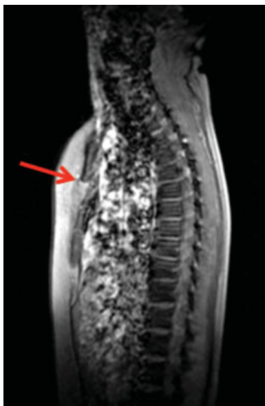
Fig. 2 T2-weighted sagittal MRI showing the fracture (indicated by arrow) of the sternum. MRI, magnetic resonance imaging.

Ultrasonic imaging was performed by pediatric radiologists using a Philips iU22 scanner (Philips AG Healthcare, Zürich, Switzerland) equipped with a 12–5 MHz linear transducer.