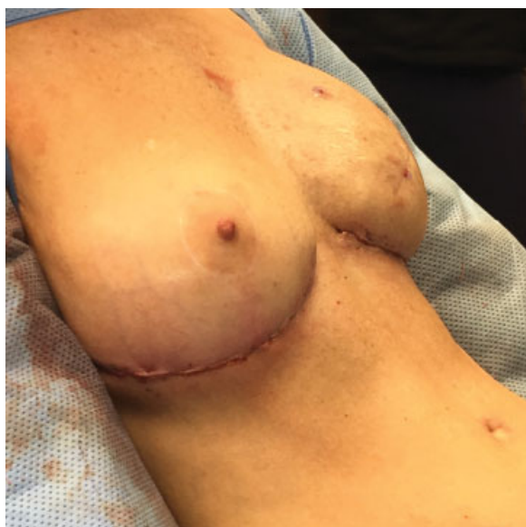
Fig. 2 Immediate postoperative result of stacked DIEP flap plus implant hybrid breast reconstruction. Note the improvement in the left upper pole eliminating the visible rippling.

complications such as infection or malpositioning which could lead to vascular compromise if the implant impinges on the flap pedicle.