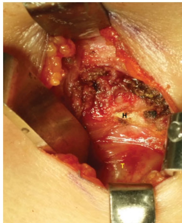
Fig. 2 The thyroid cartilage (T) and the anterior surface of the hyoid bone (H) were exposed.

on each side of the midline with a sharp needle and then directed to the thyroid lamina of the same side piercing it from the lateral to the medial surface, about ½ cm from the upper border of the cartilage. Two sutures were performed on each side. The sutures were tied steadily and gently, with the neck in neutral position (► Fig. 3). The wound was closed