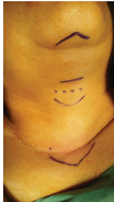
Fig. 1 Skin marks were lined over the mandibular margin, hyoid bone, thyroid notch and sternal notch.

The hyoid suspension procedure was performed under general anesthesia, with the patient in supine position with the neck extended. Skin marks were lined over the mandibular margin, hyoid bone, thyroid notch and sternal notch (► Fig. 1). The skin incision followed a horizontal skin crease between the body of the hyoid bone and the thyroid notch. The incision was carefully extended through the subcutaneous tissue and platysma muscle, as the muscle is less defined in the midline. Upper and lower subplatysmal flaps were elevated to expose the strap muscles, which were separated in the midline. The plane of the thyroid cartilage and the surface of the hyoid bone were exposed and the thyrohyoid membrane was clearly defined (► Fig. 2). Vicryl 0 was wrapped around the body of the hyoid bone