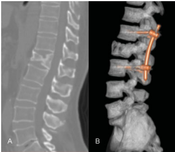
Fig. 1 Case example of the open pedicle screw fixation (OPSF) technique. A. preoperative CT scan sagittal image. B. postoperative CT scan sagittal image.

screws were positioned by C-arm X-ray examination, and were then fixed with rods. Finally, one drainage tube was placed in the suction (►Fig. 1).