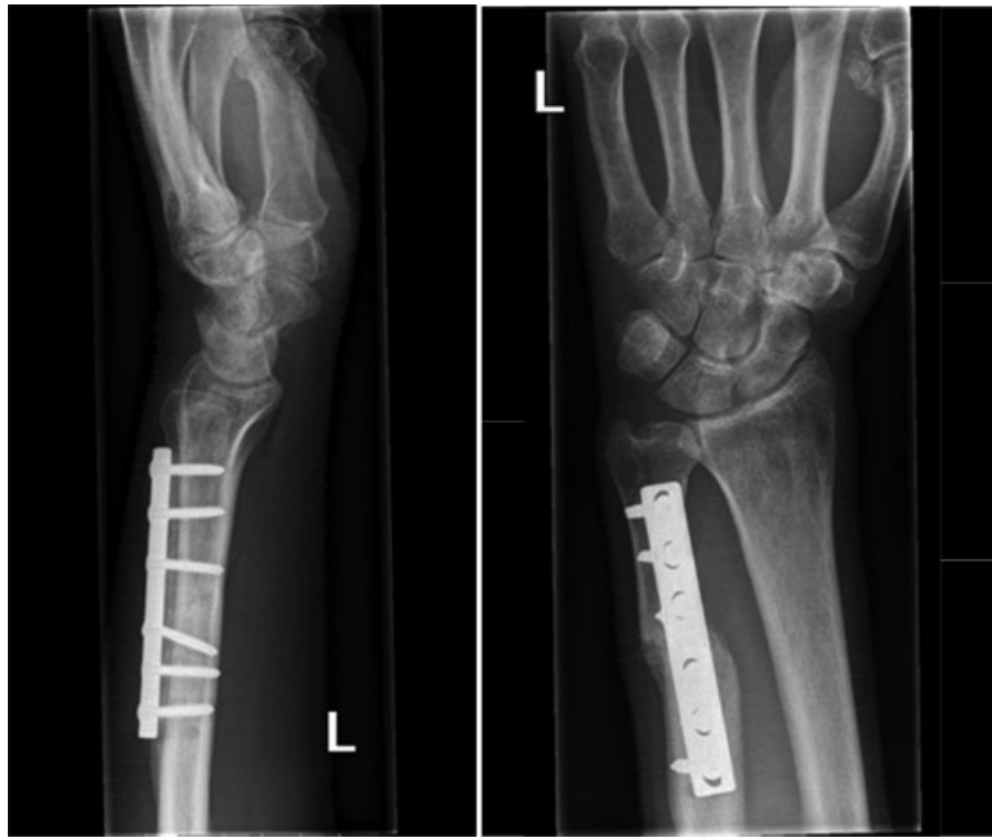
Fig. 1 Lateral and anterior-posterior views after ulnar shortening osteotomy.

All patients had been diagnosed with an ulnar impaction syndrome due to either congenital ( n = 19 ) or acquired ( n = 15 ) conditions. The symptoms included ulnocarpal tenderness, a painful ulnar stress test and positive ulnar variance on X-ray. Other potential causes of ulnar-sided wrist pain, such as arthrosis or distal radioulnar joint abnormalities had been ruled out (►Fig. 2).