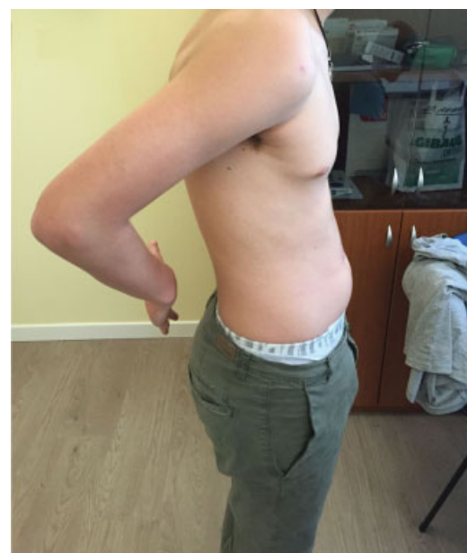
Fig. 3 Patient during the clinical examination at the latest follow-up; Lift-off test sign is now negative.