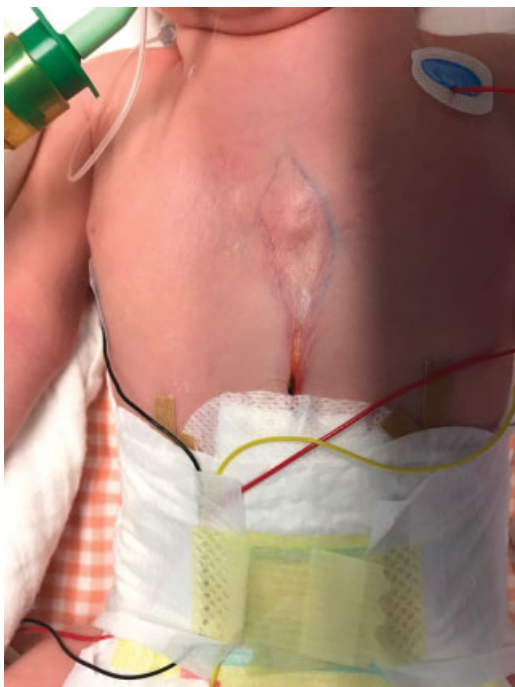
Fig. 1 Presentation of the strand with extension from the xiphoid process to the umbilical cord.

On the day 6 of life, staged surgical closure of the SC was staged by our thoracic and pediatric surgeons. Intraoperatively, the cartilage bridge including the XP was resected. Afterward, the SC was approximated by sutures [3–0 monofilament absorbable suture (Polydioxanone, PDS II, Ethicon, Somerville, NJ