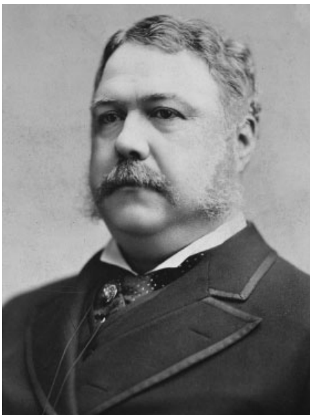
Fig. 1 Chester A. Arthur, c1881.

practice was temporarily interrupted by the Civil War when Arthur served as quartermaster for the New York regiments attaining the rank of Brigadier General. 4 As a young adult, Arthur was thought to measure ~6 feet 2 inches tall and weigh ~180 lbs. As a successful lawyer in New York, he lived a busy social life and gained the reputation for lavish eating and drinking when his weight swelled to 220 lbs. Still by examining several photographs of him as an adult, he would not be described as obese and had an approximate body mass index (BMI) of 28. 5