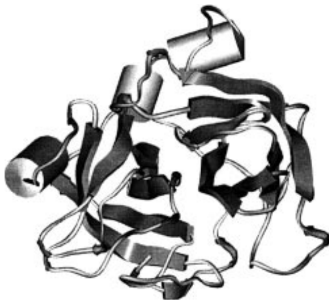
Fig. 3 Secondary structure diagram of the model of crotalase. The program INSIGHT II (Kabsch-Sander algorithm) was used to represent beta sheets as arrows (ribbons), helices as cylinders, and turns as sleeves

analyses yielded values that varied from one crotalase preparation to another (1, 5). Although N -acetylgalactosamine, as found here, does not ordinarily occur in asparagine-linked carbohydrate chains, it has now been demonstrated as subterminal to sialic acid residues of batroxobin (17, 18) and ancrod (19), partially or completely replacing galactose in that structural role. The unevenness of molar ratios among the individual sugars of crotalase most likely reflects the heterogeneity of carbohydrate chain structure often exhibited by glycoproteins.