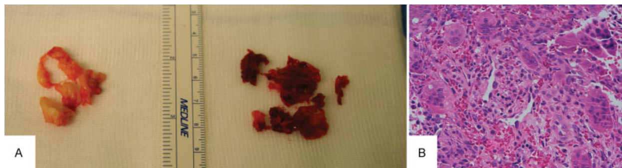
Fig. 2 Excised mass. Macroscopic appearance of the lesion (A) and histologic pattern of the pathologic tissue (B).

In the postoperative phase, a half-stitched boot was positioned with the ankle at 90° and weight-bearing was not allowed for 3 weeks. Thereafter, the valve was removed and a bivalve brace was applied, and weight-bearing was