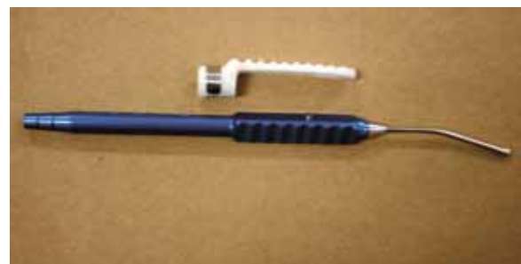
Figure 1 – Suction tube with aspiration pressure control.

The tube can be manufactured in different lengths, diameters, shapes, and angles according to the surgeon's preference and needs.