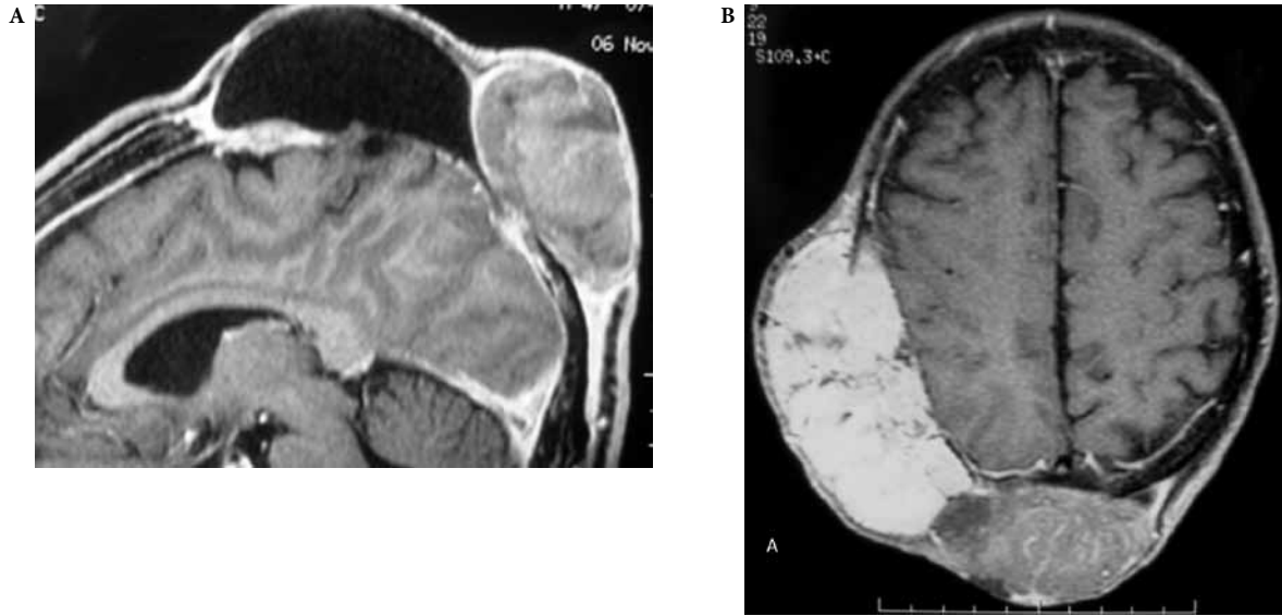
Figure 2 - (A) Sagittal view of MRI image reveals a solid-cystic lesions with apparent invasion of dural sinuses suggesting meningioma. (B) Axial view after gadolinium injection.