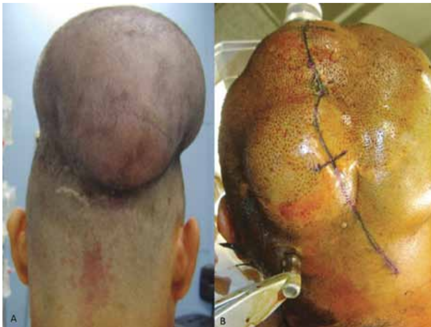
Figure 1 – Preoperative images depicting two parietal and occipital masses of approximately 10 cm and 7 cm diameter respectively.

Radiological evaluation showed parietal and occipital masses of 10 and 7 cm respectively (Figures 2A and B) and a destructive lesion of the first thoracic vertebral body compressing the spinal cord (Figure 3). Patency of the sagittal sinus was evidenced on MRI. Angiogram was not performed. Moreover, 5.0 cm pulmonary mass was detected in the right inferior lobe suggesting a metastatic lesion. Chest surgeons decide to carry out a transbronchial biopsy that was inconclusive for metastasis. Subsequently, an anterior spinal decompression, with chest surgeons' support, was performed. Lesion was interpreted as meningioma (Figure 4).