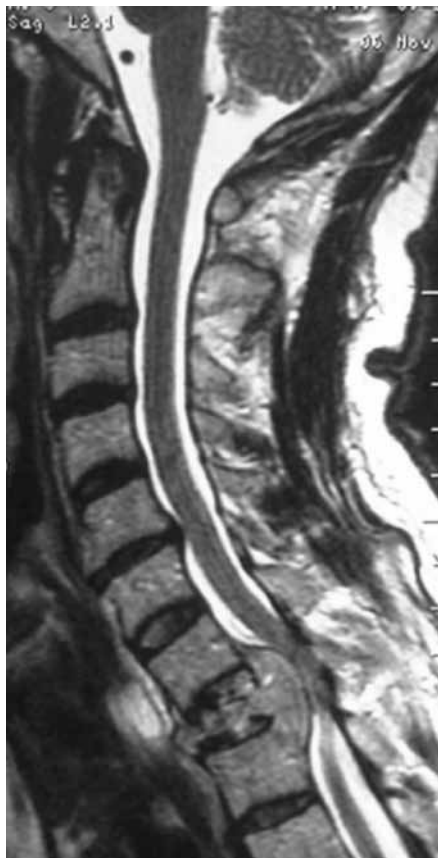
Figure 3 - MRI - Sagittal view displays extradural mass compressing the spinal cord and compromising the T1 vertebral body.