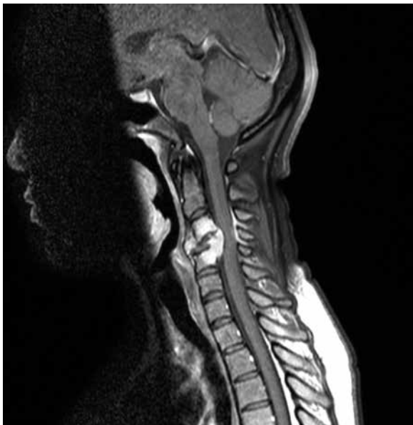
Figure 1 – Magnetic resonance imaging (MRI) sagittal contrast-enhanced T1-weighted of the cervical spine revealed lowering and flattening of the vertebral body of C4 and involvement of C3 and C5 vertebral bodies.

The patient underwent an open surgery of the lesion and she was treated by anterior resection, then by C3 to C5 vertebral body removal. The tumor was richly vascularized, soft consistency, violet colored, presenting no cleavage plane related to the contiguous soft tissue. During the same surgical procedure the patient underwent a spine roller fixation with iliac bone graft from C2 to C6. Twelve days after, the patient was subsequently taken to the operating room and underwent a posterior cervical spine fixation with inter spinous titanium wire and iliac bone bars from C2 to C6 was also performed. Then a laminectomy at C3 and C4 level was accomplished for dural bag decompression. Histological sections of the tumor showed multinucleated giant cells. These histological features were diagnostic of giant-cell bone tumor.