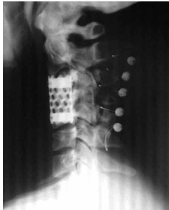
Figure 3 – Post operative lateral X-ray showing spine fixation.