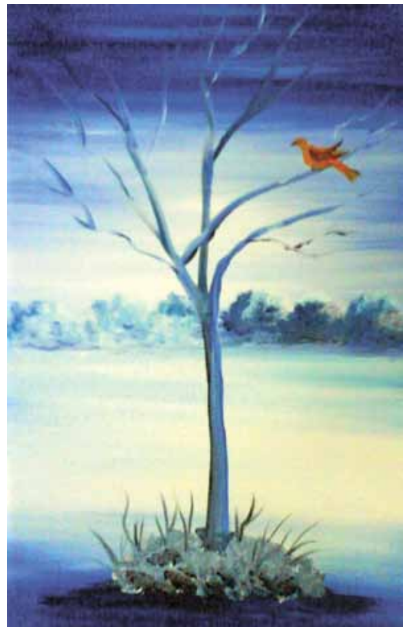
Figure 4 – Oil on canvas by a patient with attentional, executive and constructional praxis deficits after TCE and several sessions of cognitive rehabilitation.

According Persinger, 3 patients with cerebral injuries learn because the sparing neurons are activated; the learning of a new task is not a synonym of recuperation, however it necessarily reflects re-adaptation (Figure 4).