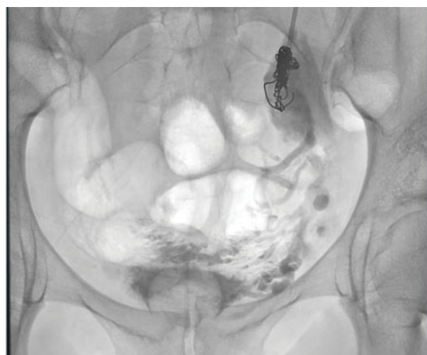
Fig. 2 Fluoroscopic view of the abdomen and pelvis demonstrates sodium tetradecyl sulfate and contrast in the deep pelvic varices with a coil in the left gonadal vein.

The diameter of ovarian veins based on catheter venogram ranges from 6.2 to 14.6 mm; no correlation is identified comparing diameter to symptom improvement. 21,31-35