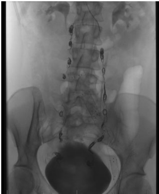
Fig. 3 Fluoroscopic view of the abdomen and pelvis demonstrates coils in the bilateral gonadal veins.