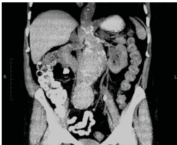
Fig. 1 An asymptomatic juxtarenal 10 cm abdominal aortic aneurysm identified as incidental finding.

therapy and weekly follow-up for the possible signs of limb ischemia.