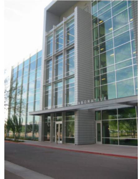
Fig. 1 The new Arizona Biomedical Collaborative-1 building on the Phoenix Biomedical Campus, housing the Arizona State University Department of Biomedical Informatics on the first two floors. The upper two floors are occupied by the Department of Biomedical Sciences of the University of Arizona College of Medicine-Phoenix in Partnership with Arizona State University (COM-PHX).

As mentioned, the PBC also is home to the Translational Genomics Research Institute. (TGen), a non-profit organi-