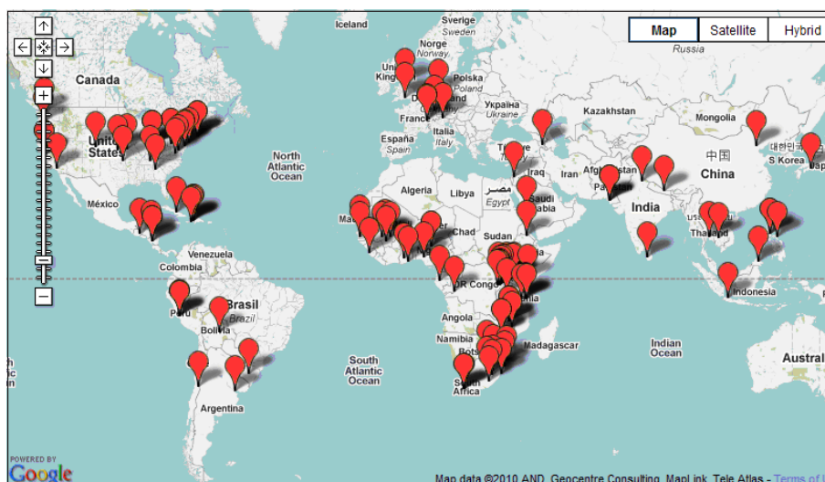
Fig. 3 Geographical Distribution of Known OpenMRS Implementations

OpenMRS has participated in the GSoC programme for the past three years and, in 2010, had one of the highest number of interns funded by Google of any open source project. In 2007,