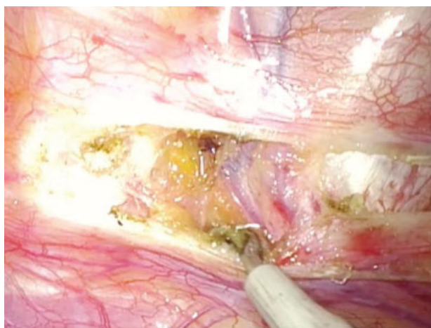
Fig. 3 The intercostal space and its neurovascular structures, which were also preserved after ramicotomy.