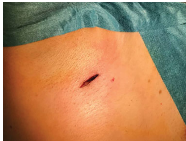
Fig. 1 Video-assisted thoracoscopic surgery through a 1-cm incision for inserting a 5-mm trocar and 5-mm electrocautery device.

Bilateral miniuniportal VATS ramicotomy (► Video 1 ) was performed through a 1-cm incision at the middle of the transverse axillary line via the third intercostal space (► Fig. 1 ). A 5-mm trocar was inserted into the thoracic cavity to guide the 5 mm thoracoscope. ► Fig. 2 presents the sympathetic chain with the rami communicantes of the sympathetic ganglions. Through the same incision, a 5-mm endoscopic, monopolar, electrocautery hook was inserted. After visual identification of the sympathetic chain, the parietal pleura was incised with 5 to 10 mm distance from the main sympathetic chain. Further on, the rami communicantes (Th2–Th5) were transected with electric cautery in 5 mm distance from the sympathetic ganglion. Thereby, the main sympathetic trunk remained intact. The intercostal space and its neurovascular structures were