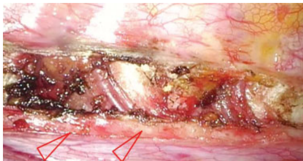
Fig. 4 Preserved sympathetic chain after resection of the rami communicantes from the second ganglion to the fifth ganglion.