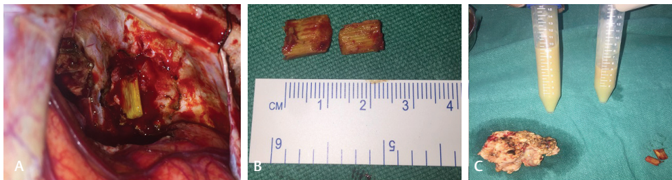
Fig. 3 Intraoperative picture showing foreign body into the orbit (A), approximately 1 × 1 cm size two wooden foreign bodies (B) and (C) in the abscess wall.

Postoperative course was uneventful. Patient received intravenous antibiotics for two weeks followed by oral antibiotics for four weeks. Postoperative ophthalmic examination revealed no abnormality. At three months follow up, there was no evidence of orbital infection or recurrence of intracranial abscess.