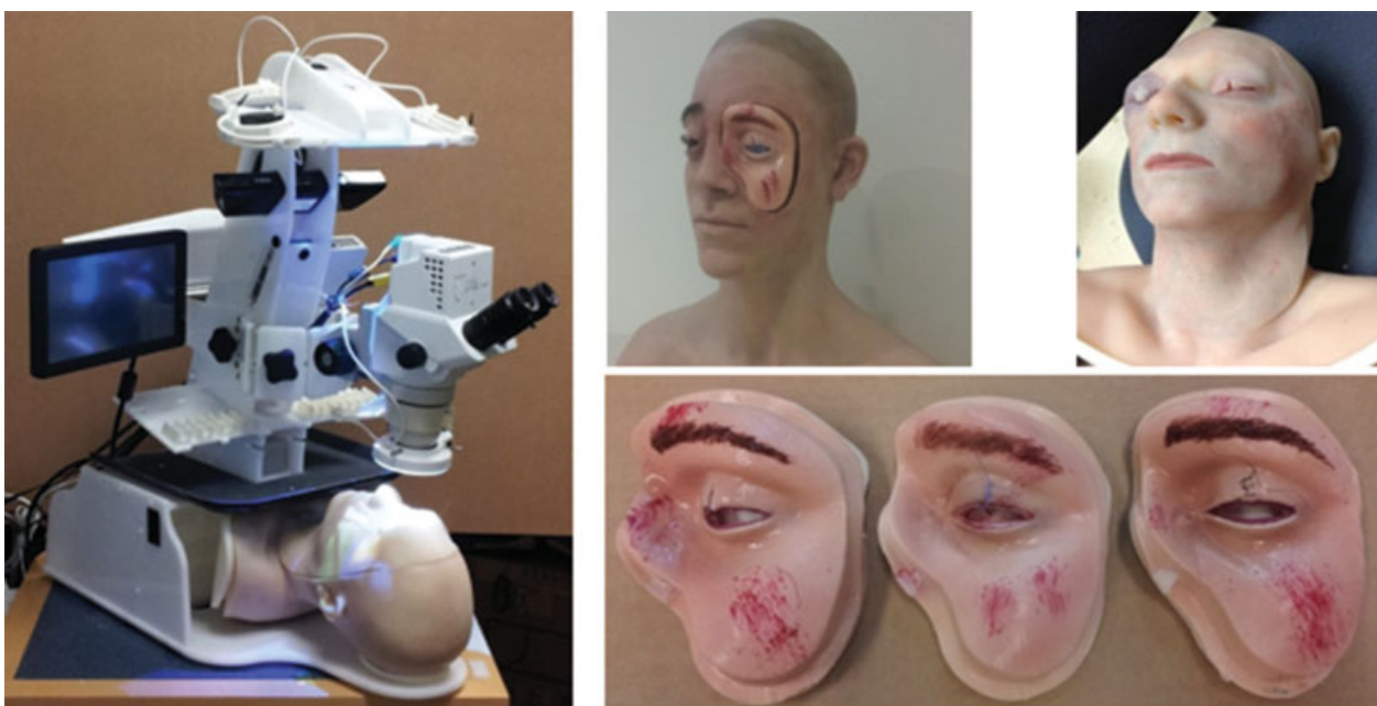
Fig. 2 Ocular and Craniofacial Trauma Treatment Training System with optional microscope attachment.