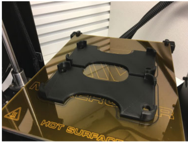
Fig. 1 Printing of slit-lamp cellphone adapters.

One such project involved the manufacturing of slit-lamp cellphone adapters (► Fig. 1 ) customized for various slit-lamps and cellphones by measuring the dimensions of the slit-lamp oculars and the myriad cellphones owned by trainees. 2 This idea stemmed from the need for after-hours photography in the clinic and the limited compatibility of the commercially available adapters to an ever increasing number of phone manufacturers and models. These 3D-printed custom adapters were used by residents for documentation of ocular findings in the clinic and in the emergency department while on call, and provided photographs for consultation with the on-call faculty and for regularly scheduled educational case presentations. They were also used to document and teach various eye pathology and to demonstrate the use of the slit-lamp to medical students during their ophthalmology rotation. Adapters were also made to fit the surgical microscopes to obtain still images and video clips during various ophthalmic procedures. Further modification on a previously described design 3 led to the manufacturing of a customized cellphone attachment for indirect ophthalmoscopy for documenting posterior pole structures and related pathology.