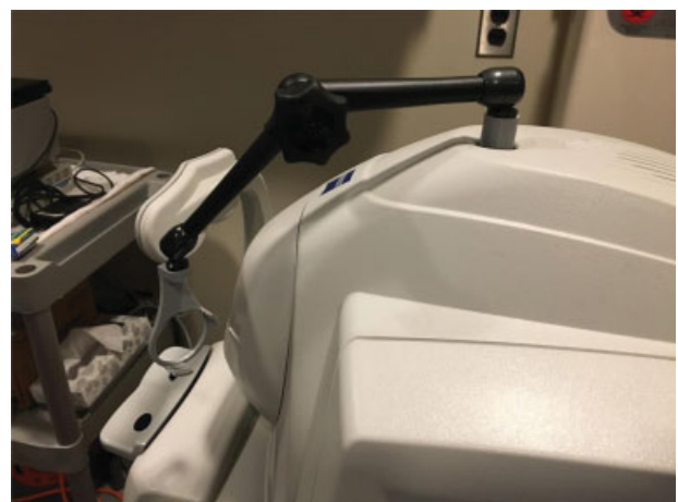
Fig. 3 OCT-mounted lens holder for an accommodation study.

Nine out of 16 respondents expressed interest in formal training in both designing and 3D printing, 3 were interested only in learning how to download and print 3D models from online repositories, 2 preferred focusing on ideas and delegating the design and manufacturing to the experienced user, and 2 felt that they had no further use for the technology.