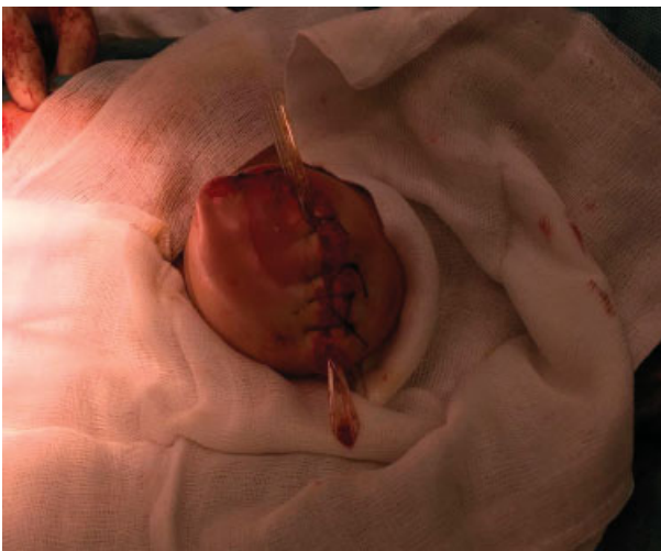
Fig. 4 Above knee amputation.

showed clear postischemic changes. The extent of brain tissue damage will be revealed during further development of the infant.