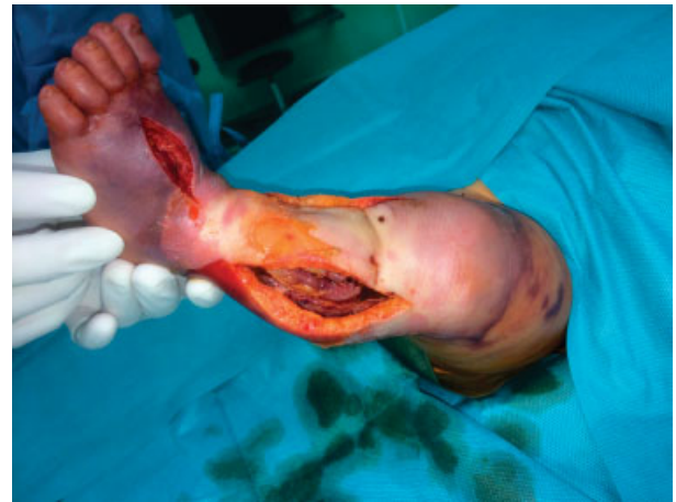
Fig. 2 Fasciotomies performed.