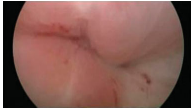
Fig. 2 Fistulous orifice viewed through cystoscopy.

planned. The fistulous tract was excised, and the bladder was sutured in two layers. ►Fig. 2 depicts the surgical specimens with the uterus and the bladder wall showing the fistulous orifices (►Fig. 2). There were no adverse events. The patient was discharged in the third postoperative day. She remained with a bladder catheter for 14 days. After the removal of the catheter, she had no more symptoms. By the time of this publication, the patient will have been asymptomatic for two years after surgery.