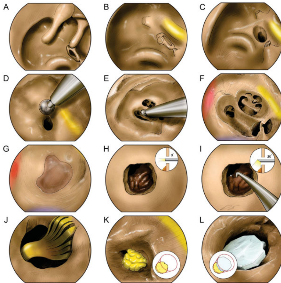
Fig. 2 Surgical procedure. (A) The tympanic membrane and skin of the external auditory canal were elevated and harvested en bloc, exposing the tympanic cavity. (B) The incudostapedial joint was separated, and the incus was removed. The tensor tympani tendon was excised, and the malleus was removed to expose the entire tympanic tract of the facial nerve. The tensor muscle was drilled using a microdiamond burr until the geniculate ganglion was visualized to identify the tympanic segment of the facial nerve. (C) The stapes was removed from the oval window to expose the vestibule. (D) The inferior lip of the oval window was gently removed using microdrills to enlarge the opening and expose the saccular fossa in the medial aspect of the vestibule. (E, F) The promontory was then drilled to expose the basal, middle, and apical turns of the cochlea. (G) Drilling was performed around the inferior aspect of the vestibule until the fundus of the internal auditory canal (IAC) was exposed. (H) The dura of the IAC was exposed completely. The vestibular schwannoma was removed from the meatus to the fundus of the IAC, preserving the facial nerve. The tumor was dissected piecemeal until radical resection was achieved. (I, J) The surgical field was reexamined using a 30-degree endoscope to identify any possible residual disease. The facial nerve was traced and its function was evaluated using a monitoring device. (K) Pieces of the ear lobule fat, tragal perichondrium, and soft tissue were harvested and used to plug the inner ear entrance. (L) The tragal cartilage was harvested, and a cartilage tympanoplasty was performed.