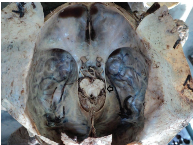
Fig. 1 Autopsy specimen showing tentorial notch (arrow).

In all the specimens, tentorial incisura was measured using vernier caliper after opening the skull and cutting the midbrain at the level of tentorial edge carefully without damaging the tentorium (► Figs. 1, 2 ). Measurements were done in millimeters.