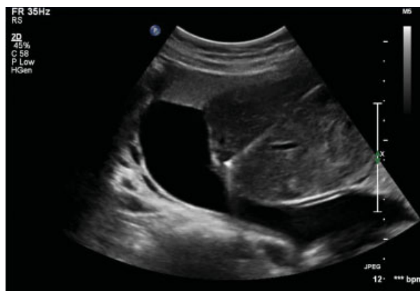
Fig. 1 Ultrasound image of 21-gauge needle placed into feeder vessel of giant placental chorioangioma. Two microcoils were then placed into the feeder vessel.

After a period of observation, the decision was made to proceed with coil embolization in conjunction with interventional radiology. A 21-gauge diamond-shaped stylet needle was passed under continuous ultrasound guidance into the single feeding vessel as it entered the tumor (→Fig. 1). Two 6 mm × 2 mm Tornado microcoils were passed into the feed-