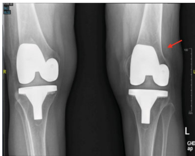
Fig. 2 Postoperative X-ray of both knees, showing right femoral implant was placed in the left knee (arrow).