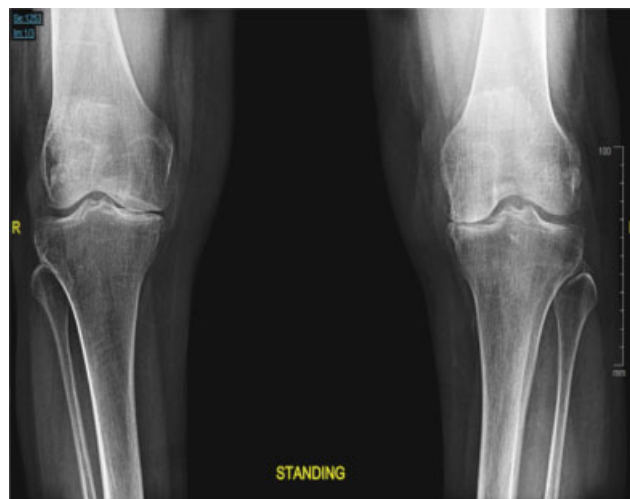
Fig. 1 Standing anteroposterior X-ray of both knees, showing severe bilateral tricompartmental osteoarthritis.