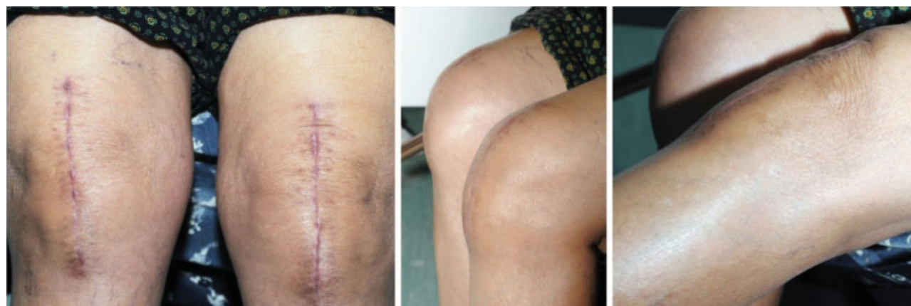
Fig. 3 Clinical pictures during follow-up showed healed scar and full functional range of motion of both knees.

however, right femoral implant was placed in the left knee instead of left femoral component (►Fig. 2). Postoperative examination showed painless full range of motion 0 to 125 degrees. There was no patellar maltracking. No popping was heard. The patient was informed about this error. She has been following up in the clinic for 5 years. She complains of mild occasional pain but otherwise is functioning well. Knee Society score was 75. Western Ontario and McMaster Universities Osteoarthritis Index (WOMAC) was 84 (►Fig. 3).