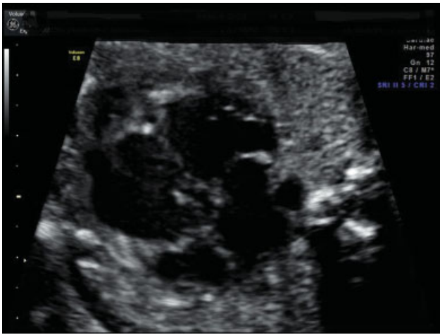
Fig. 1 Both ventricles appear dilated with enlarged ventricular cavity biometry. Cardiac walls appear thickened and irregular on the endocardial side, especially in the apical area. First magnification.

(► Figs. 1 and 2 ). A color Doppler exam showed the presence of trabecular accentuation, protruding in the ventricular cavities due to the presence of color signal in the myocardial thickness. The absence of other structural cardiac anomalies was confirmed, and the Doppler velocimetry of the heart appeared normal, with no tricuspid valve regurgitation. Due to the new diagnosis, the second trimester ultrasound images were revised, and a quantitative evaluation of the fetal cardiac biometry was made according to the Shapiro Tables (1998). This evaluation, though limited, allowed to verify that the cardiac structures showed a normal biometry with non-harmonic values between them. The results of an invasive antenatal diagnosis and of infection investigations were negative. An echocardiography was performed on both