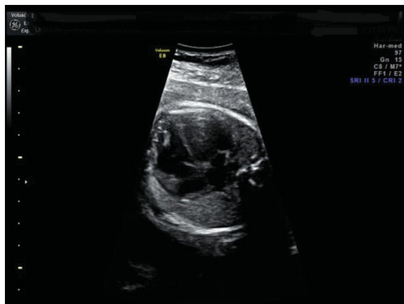
Fig. 2 Both ventricles appear dilated with enlarged ventricular cavity biometry. Cardiac walls appear thickened and irregular on the endocardial side, especially in the apical area. Second magnification.

Left ventricular non-compaction comprises the majority of the cases, but NCCM can also be seen in the right ventricle or in both ventricles. 5