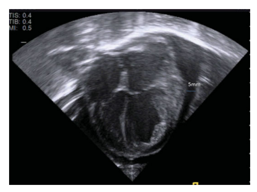
Fig. 1 Echocardiographic image showing pericardial effusion.

He developed progressive liver failure, splenomegaly with ascites. Investigations showed elevated transaminases and deranged coagulation profile. TORCH screening (Toxoplasma, Others, Rubella Cytomegalovirus, Herpes Simplex Virus), metabolic work-up including \alpha 1 antitrypsin, urine metabolic screen, and transferrin isoform were negative. Tense ascites needed peritoneal drainage of large amount of transudate. Ultrasound showed coarse echogenicity consistent with liver fibrosis/ cirrhosis and collaterals suggestive of portal hypertension.