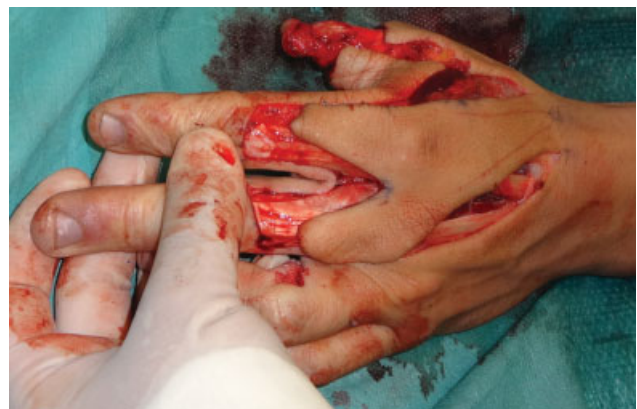
Fig. 4 A bilobed racquet flap, in this case, an extended seagull flap as described by Couceiro et al. 10

are identified with a Doppler's probe and marked with a needle. The dissection is once again started ulnarly, the area on the dorsum of the middle finger and a small section of skin connecting the index and middle finger are included as well. Great care is taken not to injure the peritenon of both digits when raising the flap. Proximally, one can proceed two ways, one with a lazy S incision, raising a fascial strip containing both neurovascular bundles with the accompanying veins and branches of the radial nerve or raising a skin paddle incorporating all of the aforementioned structures. If the fascial strip is chosen care must be taken to have a tunnel of sufficient size to accommodate both pedicles; if the flap is executed as a racquet a skin incision must be performed on the thumb to accommodate the skin. (► Fig. 4)