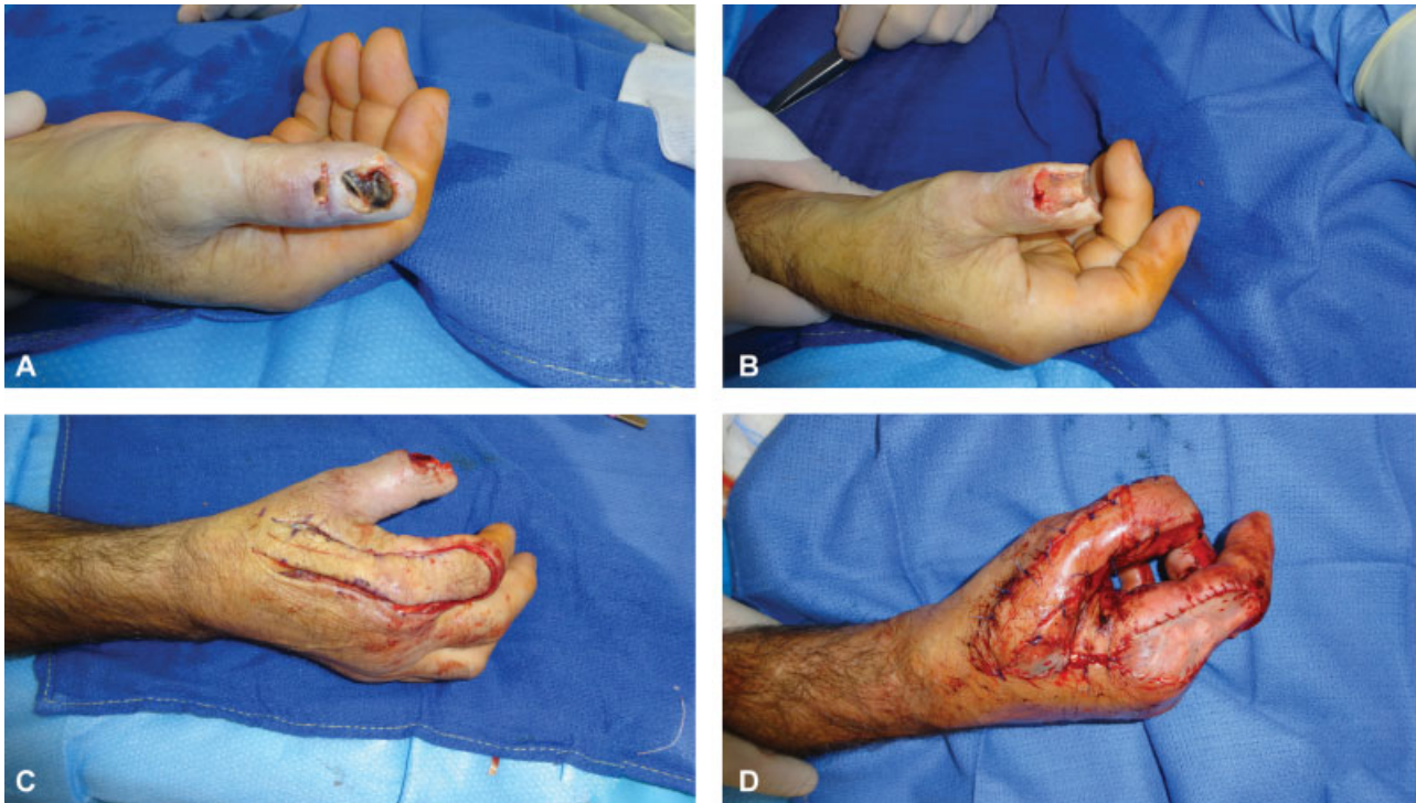
Fig. 3 Intraoperative pictures, on this case the patient had sustained a crush injury to his left thumb (A), after the resection of the necrotic areas (B), an FDMA racquet flap is raised (C) and used to cover the defect. FDMA, first dorsal metacarpal artery.

the flap at this level. When performing the radial dissection, it is possible to incorporate the dorsal nerve branch from the collateral nerve to the flap, creating an innervated FDMA flap. This nerve branch is typically sutured to another branch on the operative field in an end-to-end fashion.