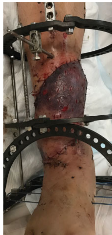
Fig. 3 Appearance of skin paddle at 3 days after surgery. Exsanguination of the skin paddle was performed with multiple skin incisions to relieve congestion after surgery.