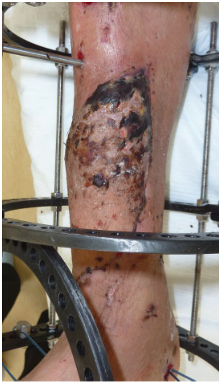
Fig. 4 Appearance of skin paddle at 3 weeks after surgery. The skin paddle became partially necrotic.