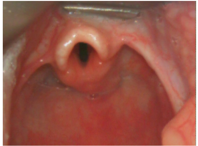
Fig. 2 Videolaryngoscopic image showing extensive hemangiomas involving the oropharynx and larynx.

neck and chest, the left internal jugular vein was cannulated, and a 5.5-F triple lumen catheter was inserted.