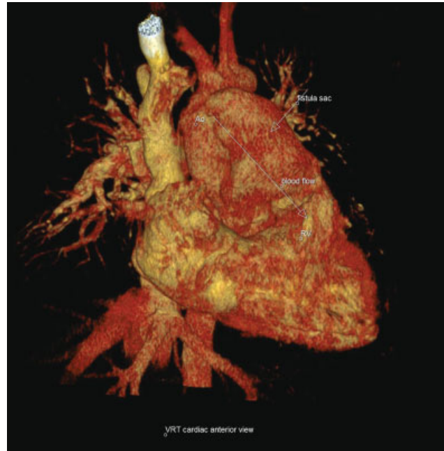
Fig. 2 Three-dimensional reconstruction of aorto-right ventricular shunt.

ened pericardium that was adherent to the epicardium. The RV was massively enlarged; there was diminished contraction in the anterior wall, whereas intraoperative TEE showed normal function of the LV. The superior vena cava was cannulated additionally, and the aortic arch was isolated from adhesions. After aortic cross-clamping distal to the aortic fistula, direct instillation of cold blood cardioplegic solution in both coronary ostia was performed. The fistula was incised anterior to the aorta, and thrombotic material was excised. It appeared that the native aorta had been eroded during pericardial infection, thereby creating a hole of approximately 0.8 cm in diameter with fibrotic rounded edges. The fistula extended under the epicardium with a cavity up to the middle of the RV partially filled with hematoma. The cavity was connected to the RV by a perforation of approximately 5 × 4 cm. Thus, we excised necrotic material and closed the perforation with multiple mattress sutures over two felt strips, with subsequent oversewing of the hematoma wall. This was followed by closure of the aortic perforation with a bovine pericardial patch (LeMaitre Xeno-Sure). The operation was terminated as usual, and the patient was extubated the next day.