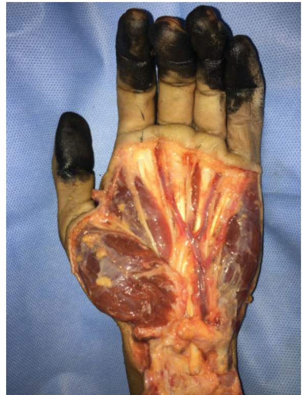
Picture 2 Left Hand. Incomplete superficial palmar arch IIB (ulnar artery supply to the ulnar border of the index finger). No superficial branch of radial artery supply is noted on the muscles of the thenar region.

the thumb) in two of the cases, one in the right hand and the other in the left hand, both in the same subject (►Picture 2). Type IA (considered the classical type) was present in one left hand (►Picture 3), and type IIA (incomplete, with supply of superficial branch of radial artery and ulnar artery) in one right hand. Seven of the palmar arches were complete and the rest incomplete (►Table 5).