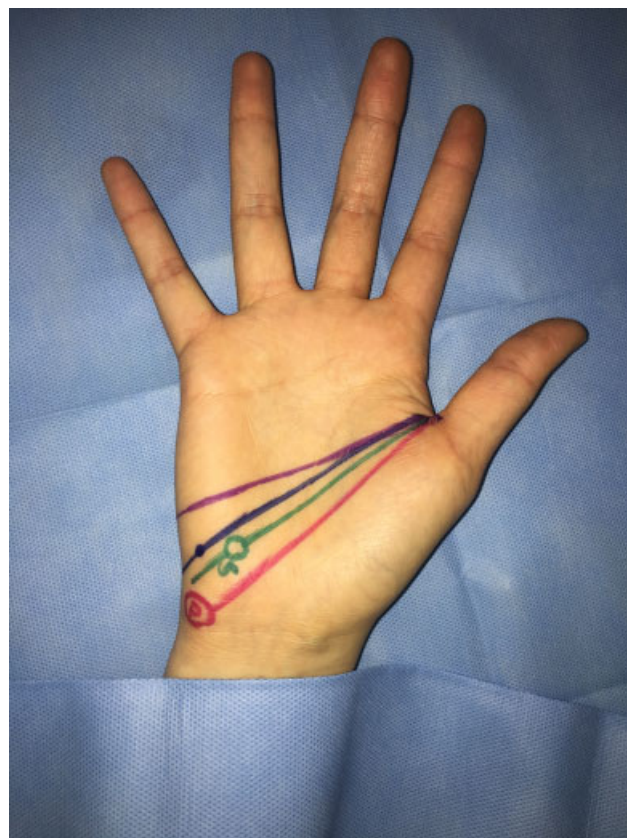
Fig. 1 Variants of the Kaplan cardinal line. Violet: original description (Line A). Blue: intersection 2 cm distal to the pisiform body (Line B). Green: intersection with the hamate bone hook. The hook is marked and identified with a G (Line C). Pink: Intersection with the pisiform bone. Line on thumb abduction axis. The pisiform bone is marked with a P (Line D).

The independent variables recorded were: age, gender, dissected side, type of palmar arch, and the Kaplan cardinal line that corresponded to the start of the curve of the superficial palmar arch.