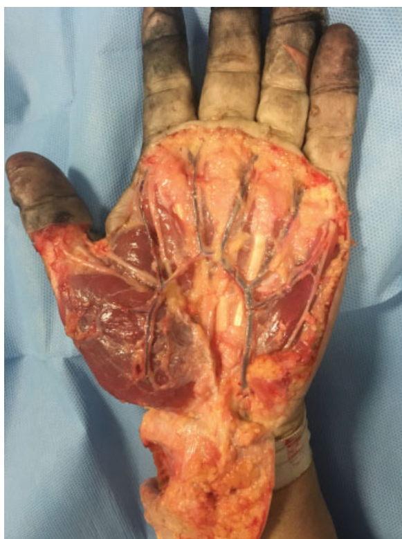
Picture 3 Left hand. Classic complete palmar arch IA. With anastomosis between the radial and the ulnar artery.

frequency between the different subtypes of palmar arches depending on the classification used. ► Table 8 shows the frequency of complete, incomplete, and ulnar type superficial palmar arch, depending on the classification used.