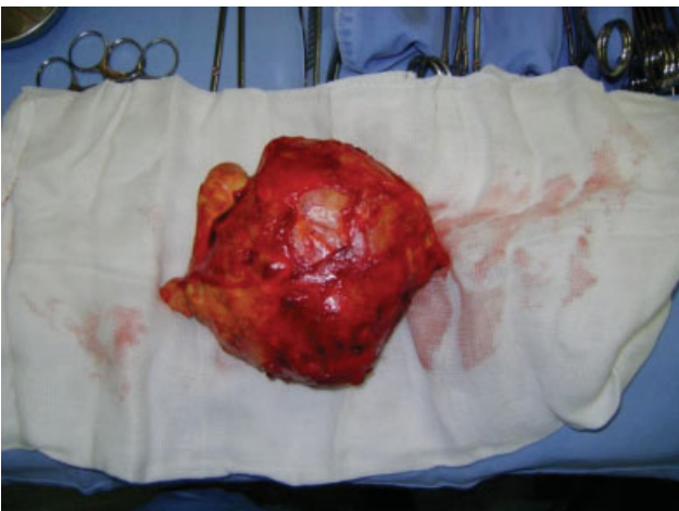
Fig. 3 Surgical specimen compatible with a “stone baby,” the product of a term abdominal gestation.

Atrash et al 3 demonstrated, from an analysis of 11 abdominal pregnancy-related deaths and an estimated 5,221 abdominal