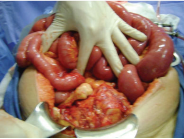
Fig. 2 Intraoperative view of the abdominal cavity showing the mass, including visible bone structures, compatible with a mummified fetus (lithopedion) in the pelvis.

ischemia; the mesenteric vessels were palpable. The liver, the gallbladder and the common bile duct did not present any macroscopic alterations. The uterus and right fallopian tube were identified as being intact, without visualization of the left tube after surgical excision of the fetus. A lysis of adhesions, dissection and resection of the mummified fetus was performed, without complications, during the surgery. By the analysis of the weight and size of the piece, along with the radiography performed, the fetus was compatible with a term gestation (→ Fig. 3 ). The patient remained in the intensive care unit during the first three postoperative days, breathing in ambient air. She presented right pneumothorax after deep vein puncture, which was drained in water seal for four days. She developed satisfactory results, being discharged eight days after surgery.