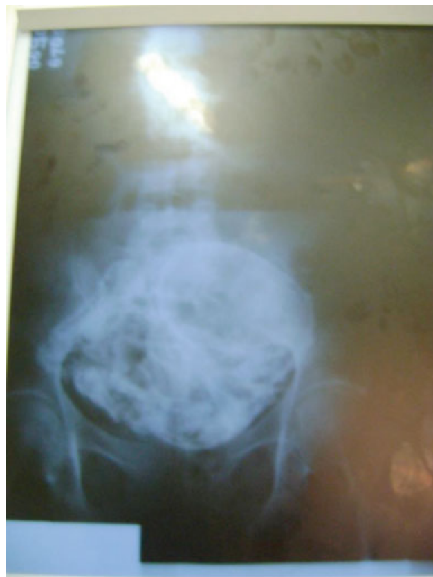
Fig. 1 Abdominal radiography showing a 20- × -15-cm radiopaque image with organized bone density in the hypogastrium and, in addition, significant distension of the loops and air-fluid levels.

The abdominal ultrasonography showed an image compatible with the retained fetus. In addition, a computed tomography scan was suggestive of mesenteric ischemia. In the emergency room, ~ 700 mL of fecal fluid contents were removed through a nasogastric tube, with concomitant volume replacement and analgesia. After the diagnosis of intestinal obstruction, the patient underwent an exploratory laparotomy six hours after hospital admission. The surgical inventory of the cavity confirmed the presence of a mummified fetus in the pelvis (► Fig. 2), as well as adhesions of the pelvis at 60 and 80 cm from the ileocecal valve and, at 10 cm from this location, an adherence between the ilium and the fetus. The small intestine loops were distended, with violet color and without signs of