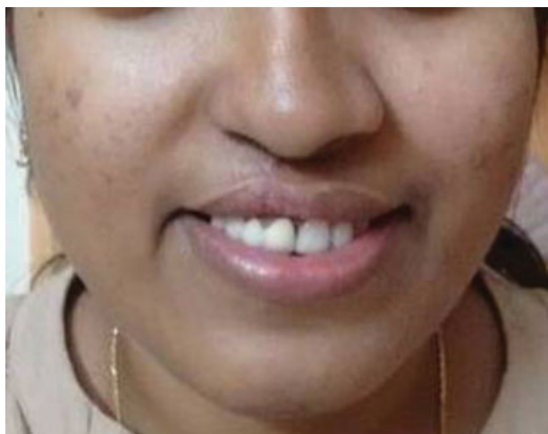
Fig. 1 A 20-year long-term follow-up of operated unilateral cleft lip.