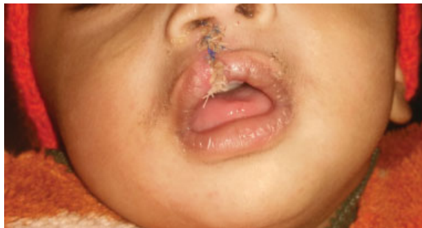
Fig. 4 Serosanguineous crusting on cleft lip suture site.

the other hand, the Millard's technique creates a simple uninterrupted vertical scar along the philtral column which contracts due to the lack of a break point in the scar. Both these scars need meticulous care 12 in the postoperative period.