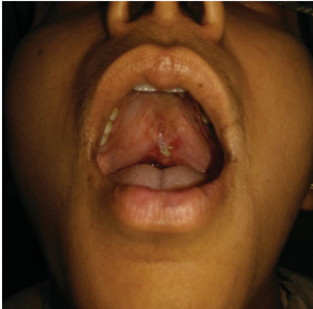
Fig. 7 Cleft palate suture line showing food debris.

rise in pressure. The chance of damage to the sutured fragile nasal layer although minimal, always exists.