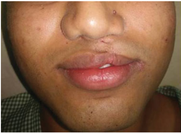
Fig. 5 Vermilion notching and contracture.