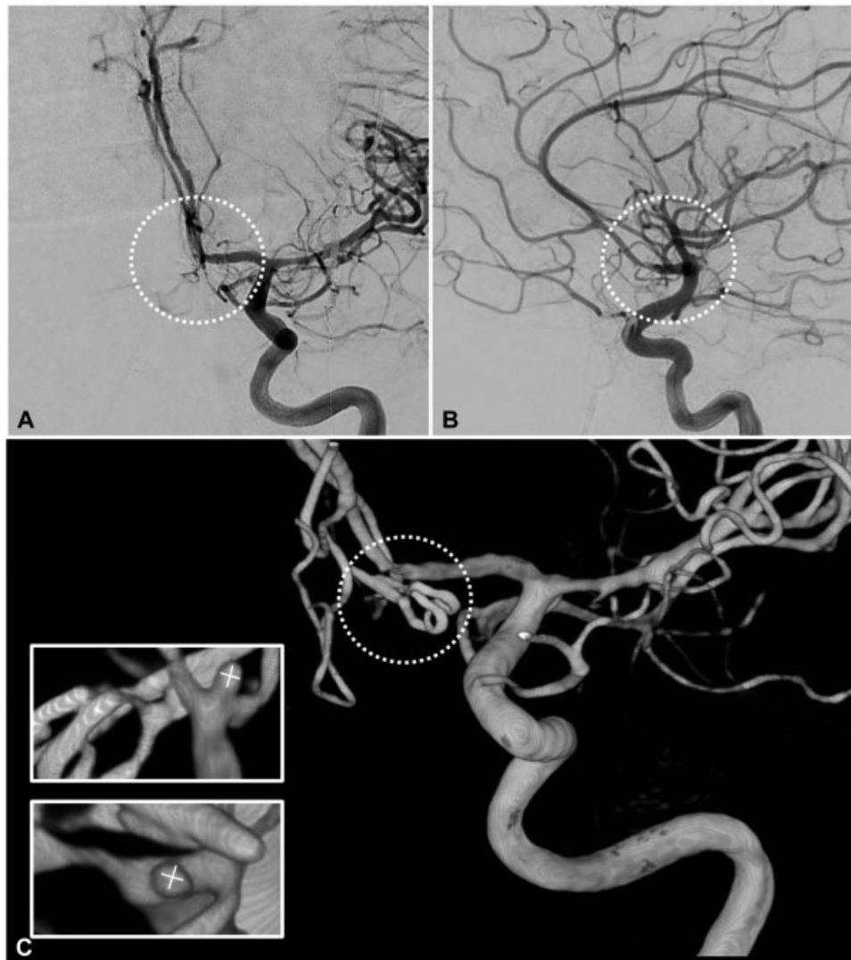
Fig. 2 Intraoperative remnant. Standard intraoperative two-dimensional digital subtraction angiography (2D-DSA) in anteroposterior (A) and lateral (B) projections shows the small remnant is barely visible and obscured by surrounding vessels. In multiplanar intraoperative 3D-DSA (C), viewing angles are unrestricted. Clipped intracranial aneurysm complex can be virtually rotated in any direction (C, inset) to identify and measure the small dog-ear remnant ( 1 \times 1.5 \times 1 mm) without interference of clip masses or adjacent vessels.

declined the planned 6-month follow-up imaging. At annual follow-up examination, angiography demonstrated a large ( 7 \times 11 mm) recurrence. With consensus of our interdisciplinary team, the patient underwent coiling of the regrown IA. At 6- and 18-month follow-up, DSA studies demonstrated complete IA occlusion ( \blacktriangleright Fig. 3).