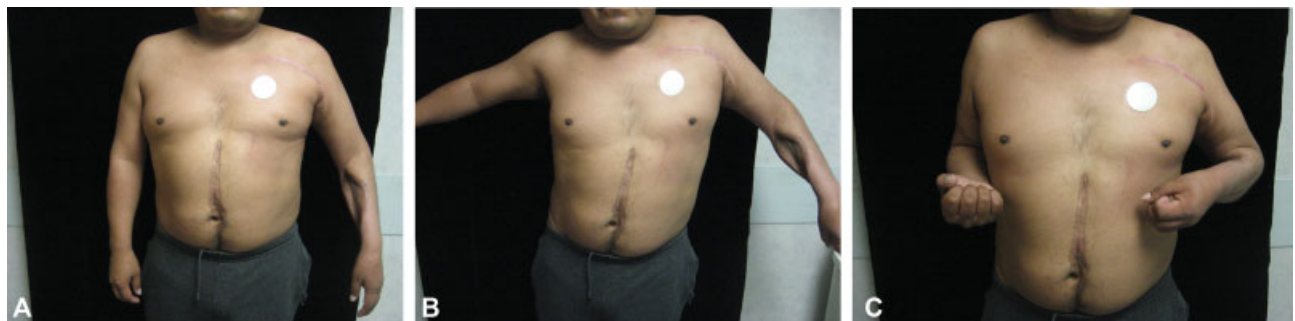
Fig. 2 Photograph of patient demonstrating postoperative shoulder range of motion.

lost to follow-up. Of those seven patients, the range of shoulder abduction was from 45 to 90 degrees (median: 45 degrees) (→Fig. 2). There were two patients that had complications related to the transfer, necessitating additional procedure(s), including drainage of seroma, debridement of necrotic tissue, and removal of eroding suture. Following intervention, no additional complications were