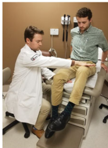
Fig. 1 Hoover sign: demonstrated in supine and sitting positions.

99.7%) but not very specific (7.3–23.7%) 39,42,43 and the phenomenon has been identified in other rare neurologic conditions (ischemic or hemorrhagic stroke involving ventroposterior thalamus, 44,45 corona radiata, 46 paramedian dorsolateral pons, 47 lenticulocapsular region, 46,48 and parietal lobe 49 ); therefore, it should be used with caution. 43