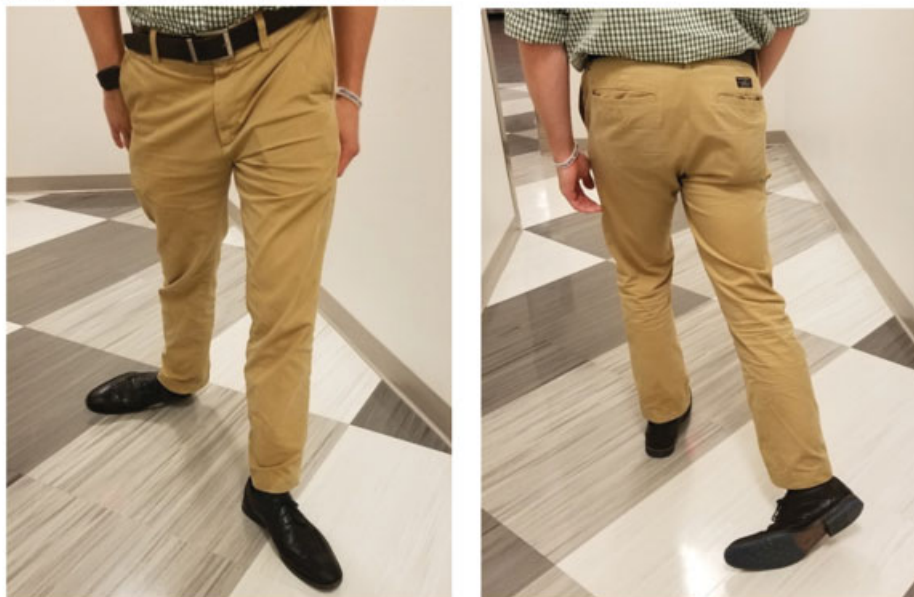
Fig. 3 Dragging monoplegic functional gait. Anterior and posterior view.

and 93% specificity. Furthermore, the authors of this study noted that if an event lasted at least 5 minutes, its odds of being PNES over ES are 24 times higher. 62 This information should be used with caution; however, as an alternative to PNES in this situation is status epilepticus which is a neurological emergency. Documenting in the medical chart that an individual has a confirmed history of prolonged PNES events (nonepileptic status epilepticus) may help prevent iatrogenic injury from unnecessary urgent medical procedures such as intubation. Although some studies show that patients with PNES can have multiple stereotyped events, studies comparing PNES with ES have found that the stereotypy or variability of a patient's events is insufficient to distinguish PNES from ES. 61,65,66