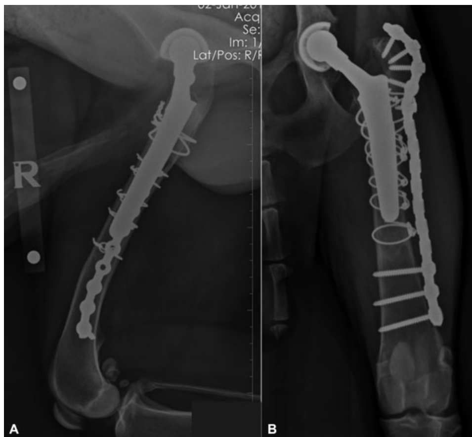
Fig. 4 Forty-eight months postoperative imaging. (A) Mediolateral radiograph of the right femur; (B) Craniocaudal radiograph of the right femur. The antibiotic-impregnated bioabsorbable beads have been absorbed and no indication of sepsis is present.

low or undetectable, decreasing the risk of drug reactions and systemic toxicosis. Implantation of antibiotic medications during surgery also negates the risk for non-compliance of medication administration postoperatively, which can be a problem in some veterinary patients. 31