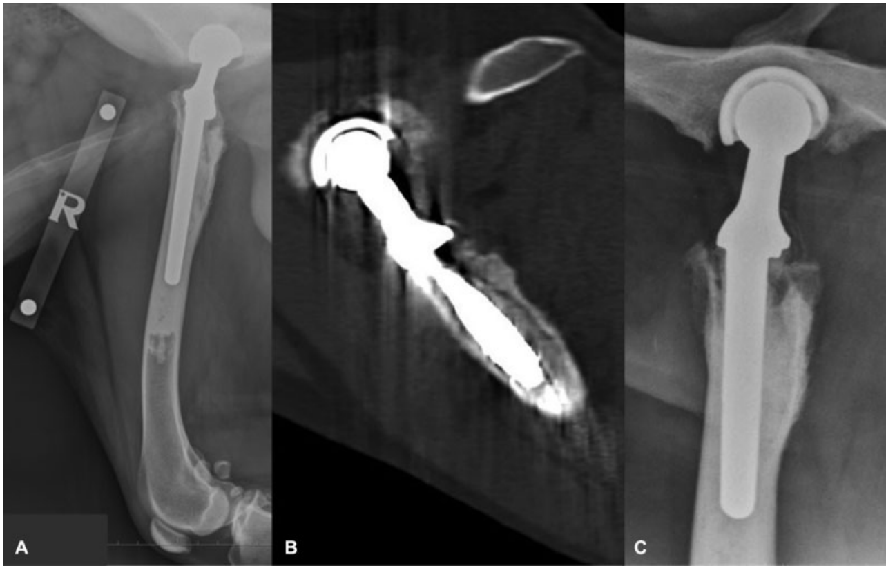
Fig. 1 Preoperative imaging. (A) Mediolateral radiograph of the right femur; (B) Sagittal slice computed tomography through the right proximal femur; (C) Ventrodorsal open limb pelvic radiograph of the right prosthetic coxofemoral joint. Images show bone lysis due to infection at the periphery of the cement mantle at the proximal extent of the femur and immediately distal to the proximal extent of the femoral stem.

wires secured its position. A 3.5-mm SOP plate (String of Pearls; Orthomed, Huddersfield, United Kingdom) was applied to the lateral aspect of the femur to prevent fracture of the proximal femoral metaphysis and greater trochanter. Antibiotic-impregnated bioabsorbable beads of calcium sulphate (Rapidcure, Stimulan; Biocomposites Ltd, Keele, United Kingdom) were formed by mixing 10cc of the powdered solute with 1000 mg of vancomycin (Vancomycin; Pharmacy, Royal Surrey Hospital, Guildford, Surrey, United Kingdom) powder and 400 mg (10 mL) solution of gentamicin (Gentamicin; Amdipharm Plc, Basildon, United Kingdom). The substances were mixed for 30 seconds to form a paste, which was spread into the moulds of the bead mat (► Fig. 2). The beads were allowed to cure for 5 minutes and once solid, compressed into the femoral canal with a broach. A size 10 BFX femoral implant (cobalt chromium stem with a beaded ingrowth surface) was impacted into the femoral canal.