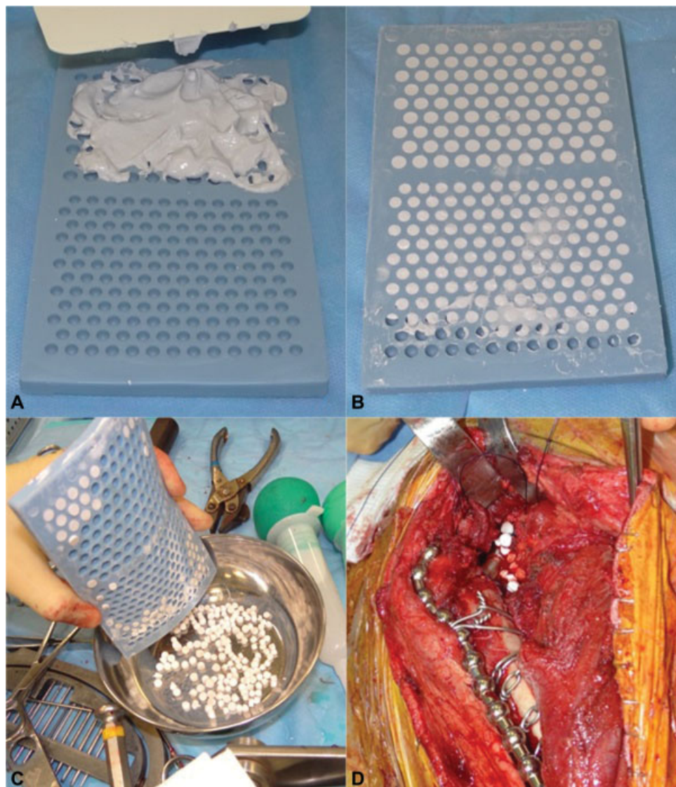
Fig. 2 Preparation and application of antibiotic-impregnated bioabsorbable beads. (A) Antibiotic solution mixed with bead solute to form paste; (B) Paste applied to mould and allowed to cure; (C) Cured beads removed from mould; (D) Placement of bioabsorbable beads around the prosthetic femoral neck.

physical or radiographical examination (► Fig. 4 ). The femoral stem subsided 7.5 mm prior to radiography 6 weeks post-surgery (► Fig. 4 ); no further subsidence occurred after this time. Radiography demonstrated complete absorption of the antibiotic-impregnated beads. At 12 and 48 months of post-surgery, gait analysis was performed by measuring ground reaction forces of each pelvic limb at walk using a force plate and the peak vertical forces were calculated (BioWare 5.1.1; Kistler Instruments Ltd., Hook, United Kingdom). Peak vertical forces were normalized to body mass. The force plate data demonstrated a symmetry index of 2.5 (12 months) and 3.1 (48 months) which is considered normal. 18 A telephone interview with the owner 60 months following revision surgery revealed the patient was still free of lameness. Analgesia and antibiotic medications were not required and activity has been unrestricted. There have been no complications or indications of recurrent sepsis for 5 years since the revision surgery.