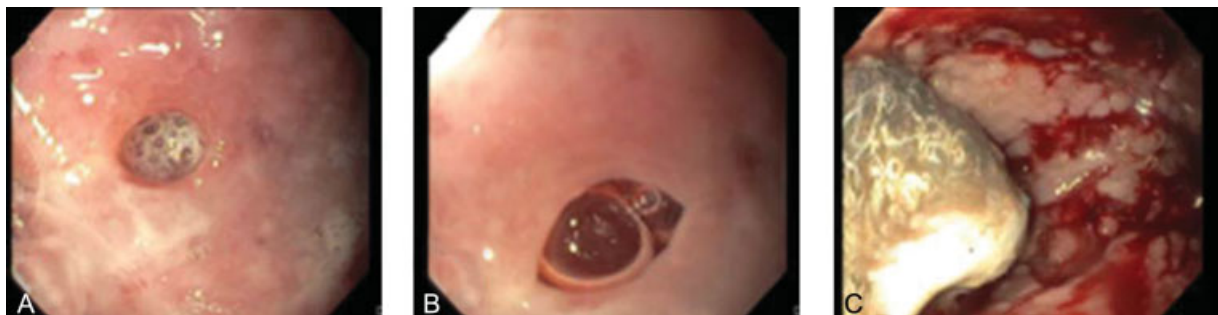
Fig. 2 Endoscopic images of gastric inflammation and gastrosplenic fistula. (A and B) Images show pictures of two separate ulcers within the gastric wall. (C) Image shows generalized inflammation and mucosal erosions of the gastric wall.