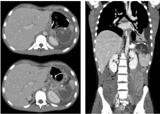
Fig. 1 CT scan images demonstrating gastrosplenic fistula. (*) shows fistulous communication between stomach and spleen. Arrowhead represents coiled feeding tube within the capsule of the spleen. CT, computed tomography.

Because of an elevated creatinine (3.4 mg/dL), an abdominal magnetic resonance imaging (MRI) was obtained which showed a small amount of perisplenic fluid and evidence of a splenic infarction. Intravenous antibiotic therapy was initiated with clindamycin. The patient recovered and was discharged from the hospital on day 9.