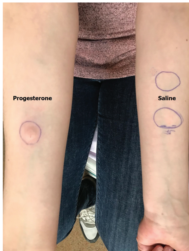
Fig. 1 Intradermal testing with progesterone was positive after 15 minutes.

progesterone was injected (► Fig. 1 ). After 24 hours, a widespread edema, itchy dermatitis, and eruptions were observed on the arm of the patient in which the progesterone was injected (► Fig. 2 ). The test results were evaluated to be positive for progesterone dermatitis. The results revealed a negative immediate response and a positive late response on the left arm of the patient, in which normal saline was injected.