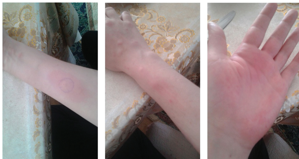
Fig. 2 Erythema on forearm and hand 24 hours after progesterone challenge.

The clinical presentation of APD is highly polymorphous, with erythematous, macular, papular and/or vesicular rashes, palmoplantar dyshidrosis, urticaria, and erythema multiforme-like lesions. Stomatitis and mucosal lesions are less common. The trunk and limbs are the most characteristically affected sites, but there have been descriptions of cases involving the face, the oral mucosa and lips or the genitals. The lesions typically and constantly relapse during the luteal phase of the menstrual cycle. The symptoms appear between 3 and 10 days prior to the menses and remit shortly after the menstruation. 4