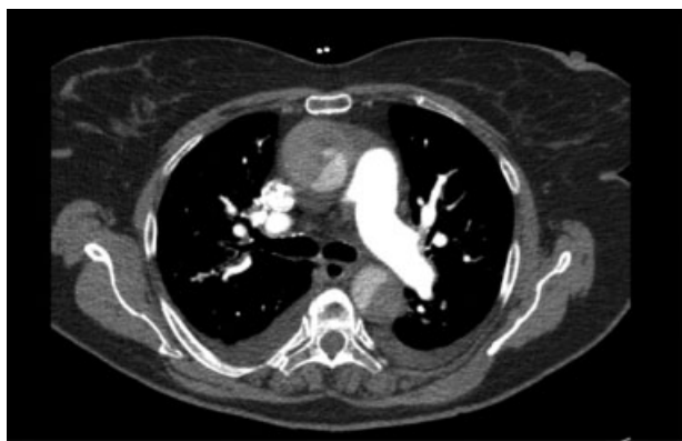
Fig. 1 Type A dissection with a definite true and false lumen and an intramural hematoma. The dissection did not extend into the arch vessels; however, it extended down the abdominal aorta. The visceral segment was not compromised, but the left renal artery originated from the false lumen.