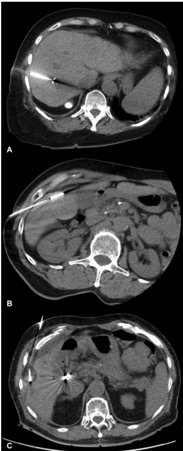
Fig. 2 Computed tomography images obtained during ablation procedures at Yale New Haven Hospital. (A) Radio frequency ablation, (B) microwave ablation, (C) cryoablation.

Significant modulations in other inflammatory markers have also been reported after RFA. In addition to its effects on T cells, Giardino et al also found that RFA was associated with a significant induction of the pro-inflammatory cytokine